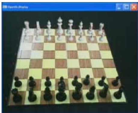
Figure 2 Augmented Reality view for the novice